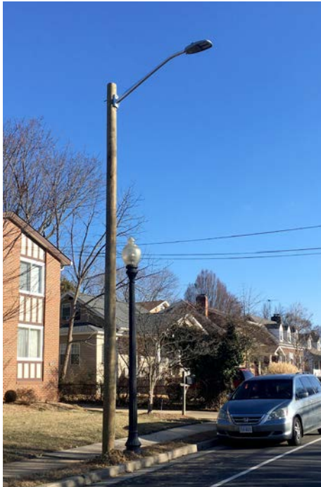
Cobra-style pole installed on 7th Street between Glebe Road and Quincy Street. See Lander's column, this page, for more information.