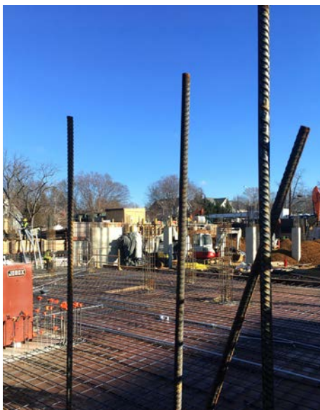
Construction is proceeding at a steady pace on APAH's Gilliam Place on Columbia Pike. It will provide affordable homes for lower income individuals and families.