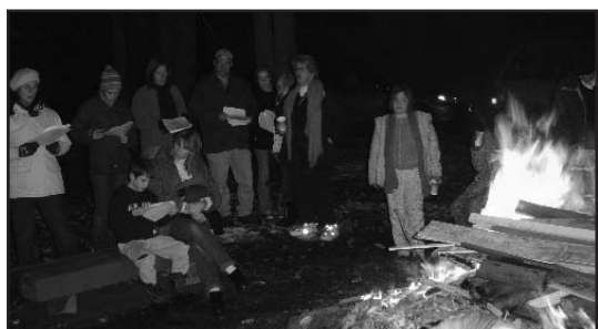
AH and Barcroft neighbors enjoy the fire