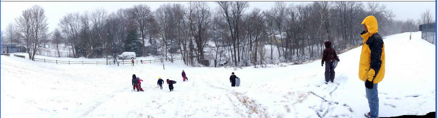
Parents watch their kids barreling down, and then trudging up, the hill close to 6th St. S. and S. Quincy St. at the National Foreign Affairs Training Center, a popular sledding venue at Sochi-Alcova.