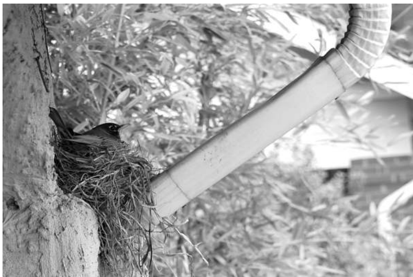
A roosting mother robin tries to blend in between a downspout and an adobe wall at a home on 9th Street.